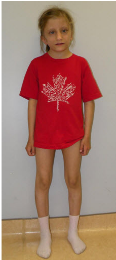
Figure 3. Frontal view of the girl in Figure 1. She has proportionate short stature with height <3rd centile.

sequence analysis first. If no pathogenic variant is found, perform gene-targeted deletion/duplication analysis to detect intragenic deletions or duplications.