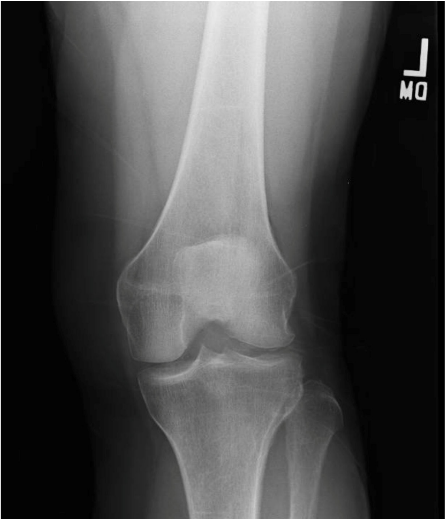
Figure 4. Radiograph of treated adult hypophosphatasia: linear sclerosis in remodeling distal femur and proximal tibia, osteophytes mid-proximal tibia, and chondrocalcinosis medial lateral compartment