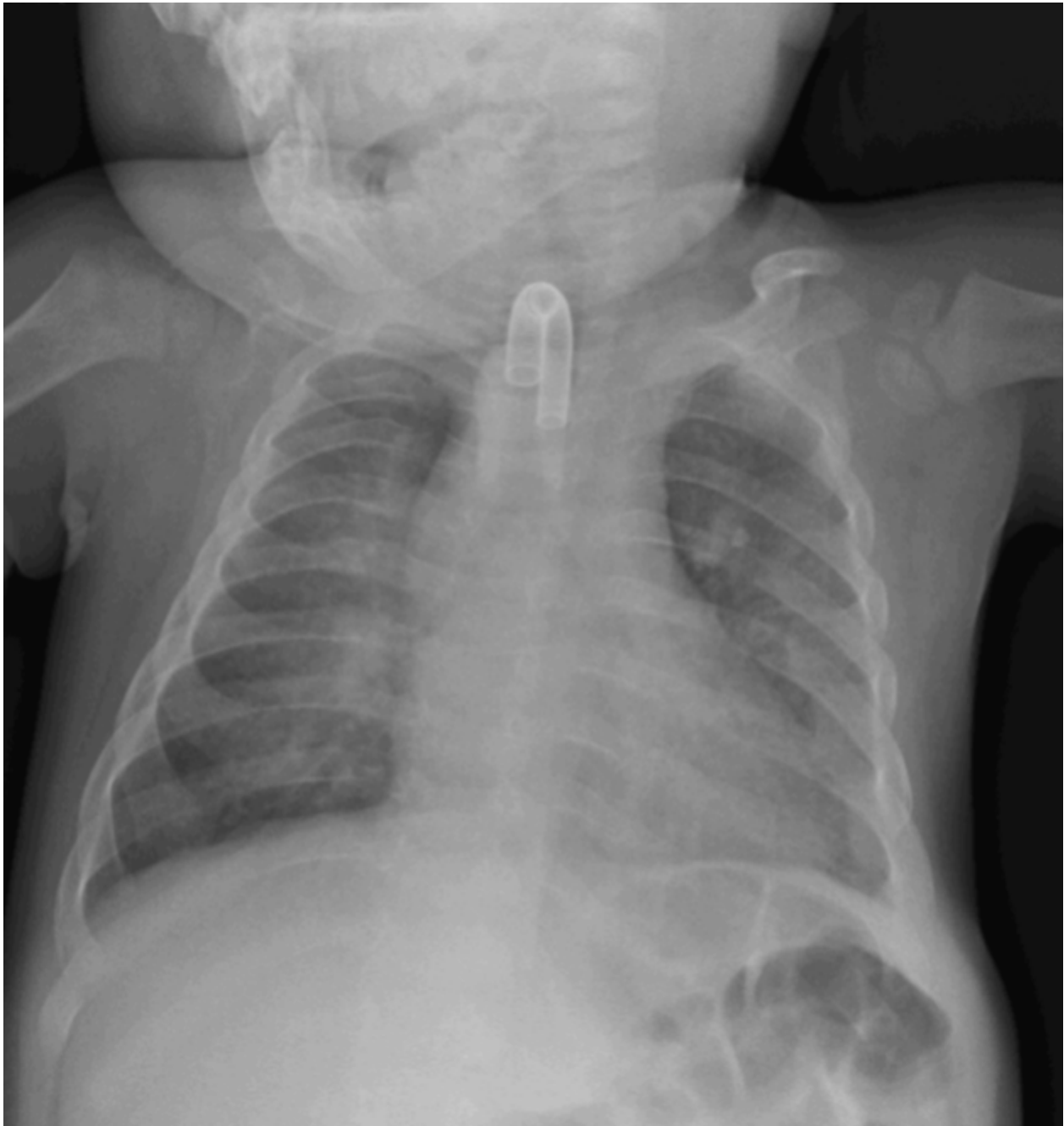
Figure 3. Radiograph of treated hypophosphatasia. Individual from Figure 2A after 12 months of asfotase alfa enzyme replacement therapy. Note tracheostomy tube, placed for laryngomalacia and bronchomalacia, features of the treated disease. Rachitic rib and metaphyseal changes have resolved. The two epiphyseal growth centers at the proximal humeri are normal.