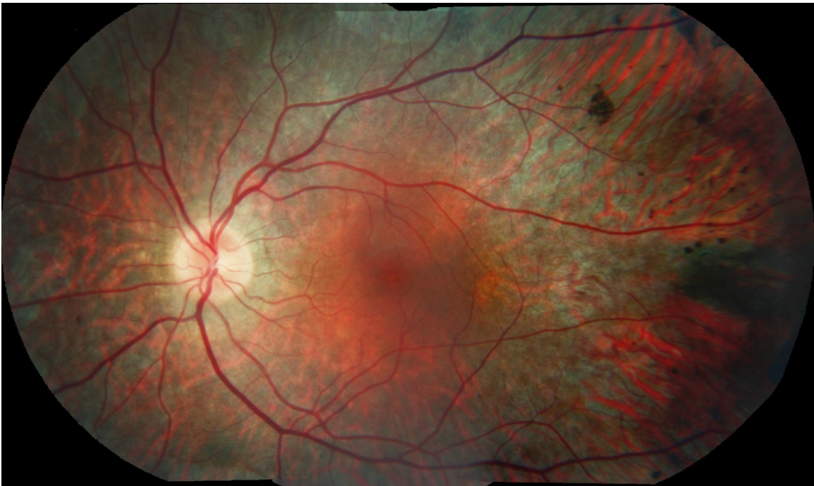
Figure 2. Fundus collage image from the left eye of an affected male with dark pigmentation age 35 years

diagnosed using gene-targeted testing (see Option 1), whereas those in whom the diagnosis of choroideremia has not been considered are more likely to be diagnosed using genomic testing (see Option 2).