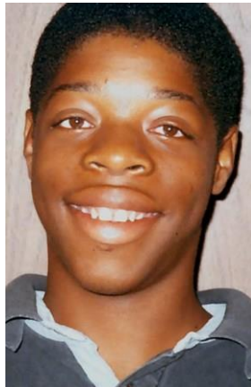
Figure 3. AP view of an adolescent showing relatively mild facial signs but with widely spaced eyes, mildly downslanted palpebral fissures, thick vermilion of the upper and lower lips, and small teeth. The columella is broad but nares are a good size. (Affected individual has a known RPS6KA3 pathogenic variant.)