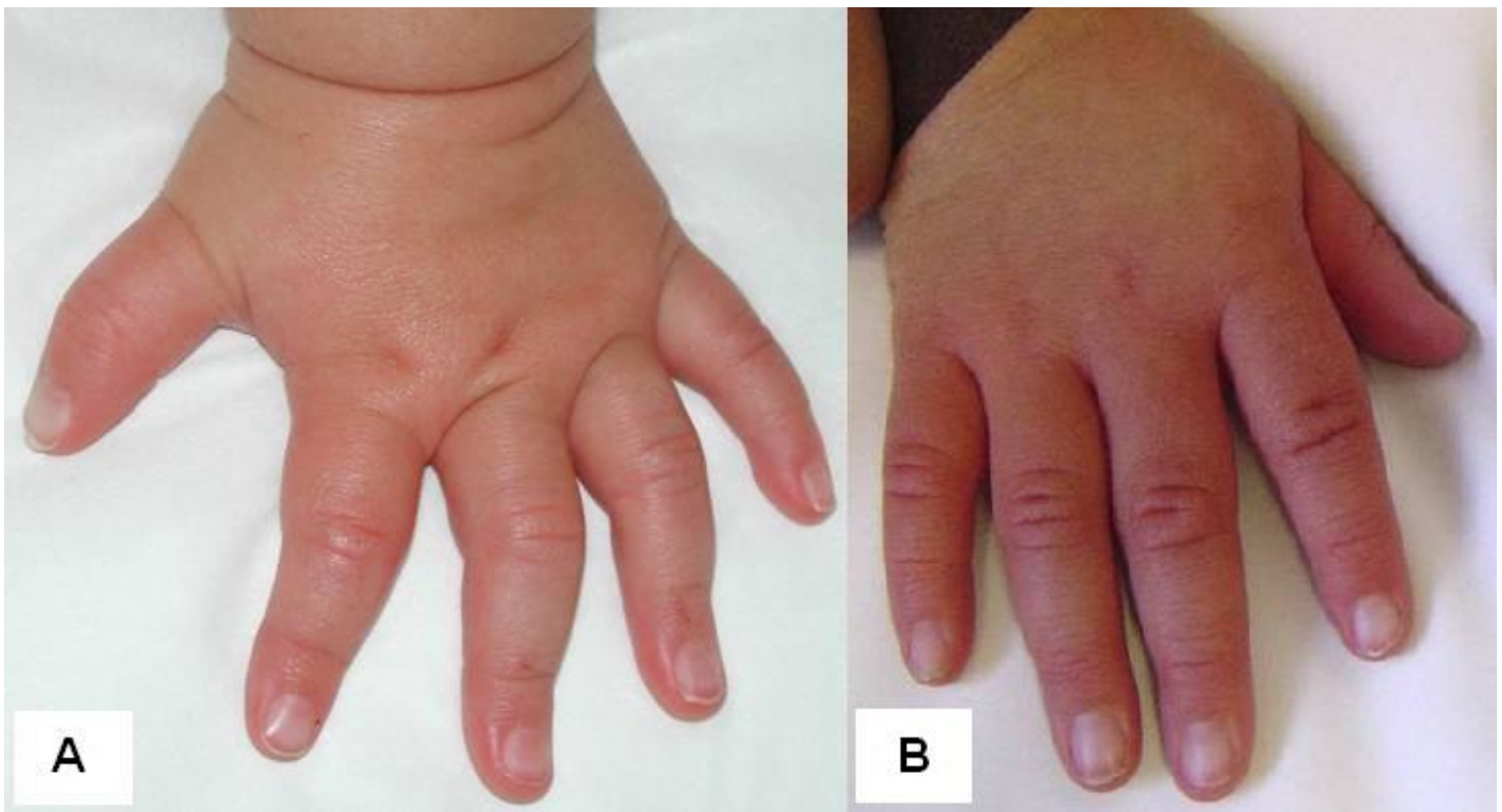
Figure 4. Hand of the child illustrated in Figure 1 and Figure 2