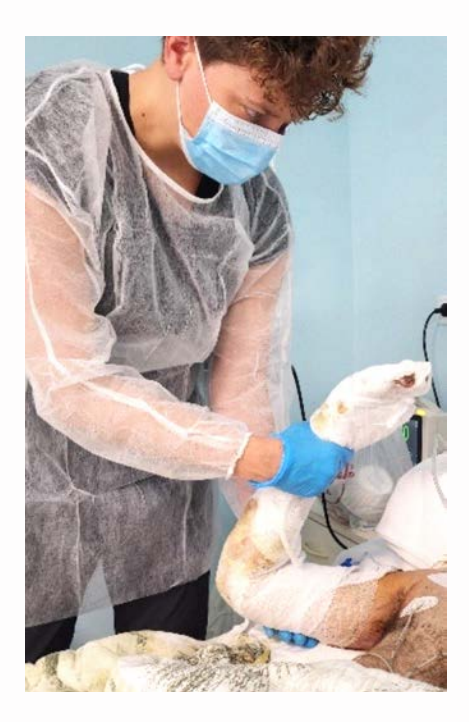
Armenia refugee response: EMT Rehabilitation Training of Trainers

On 25 September 2023, a devastating explosion occurred at a fuel depot in Armenia, resulting in a significant number of casualties. The Government of Armenia reported 170 fatalities and nearly 300 injuries. The majority of the injured were male patients with severe burns, leading to a high demand for advanced and specialized burn care. The National Burns Center, with 80 beds, was fully occupied. Eight other hospitals in Yerevan also actively provided care. The Ministry of Health issued a request for international assistance, specifically for Burn Specialist Team (BST) and medical evacuation (MEDEVAC) capacity.