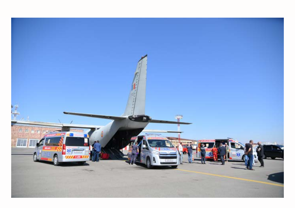
medical evacuation of burns survivors in Yerevan, Armenia

The initial request from the Ministry of Health included MEDEVAC of burn patients as well as BSTs. A total of 19 patients were evacuated in collaboration with the Emergency Response Coordination Centre. Six countries (Belgium, Bulgaria, France, Italy, Spain and the